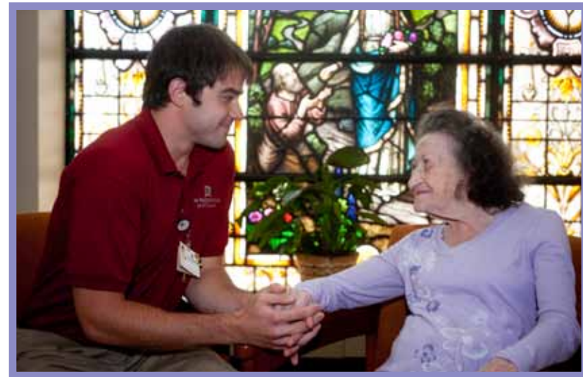
The Neighborhoods at St. Elizabeth Chapel